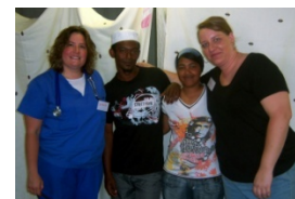
The man who brought the fish