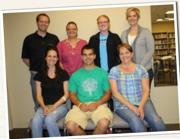
The team is preparing before serving in Mozambique